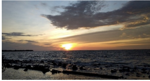
Figure 8: The appearance of the sun at 18:20 WIB

According to Rozali, a lighthouse and radar tower keeper in Teluk Rhu Village that this lighthouse can be used for observation or hilal observation. If the lighthouse is used to observe the moon, it certainly has the potential to be clearly visible to the celestial body, but no one has done that, if a device such as binoculars is brought up, it can be stored in the upper room of the lighthouse, only to go up must require energy and the load accommodated is at most 10 people, if there is really a party who wants to cooperate to use this lighthouse, it is okay and can later cooperate with the navigation party Dumai Class I. 39