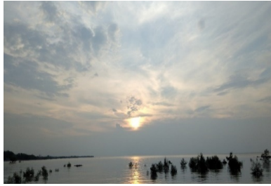
Figure 5: The state of the horizon when the sun will set at 18:12 WIB.

At 18:08 WIB, the sun was no longer visible, only a red beam of light was visible on the western horizon. At 18:20 WIB the western horizon is getting dark, the sun is no longer visible on the western horizon, and the possibility for hilal visibility is very unlikely to see the condition of the horizon that has been covered by clouds.