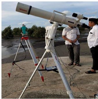
Figure 4: Location of rukyatul hilal in Selat Baru Beach.

Then the author made observations of hilal observations on 29 Zulqaidah 1442 H to coincide on July 10, 2021, the author made observations on the New Strait Beach. The calculation used is the calculation obtained by the author from THR. The hilal observation point on Selat Baru Beach which is used to perform rukyatul hilal by THR is on land that protrudes into the sea. The location of rukyatul hilal is in the form of land that protrudes slightly into the sea and in the form of a terrace that is cemented and has a good view of the horizon. This location is usually used by THR and the Regional Office of the Ministry of Religion of Riau Province to conduct hilal observations.