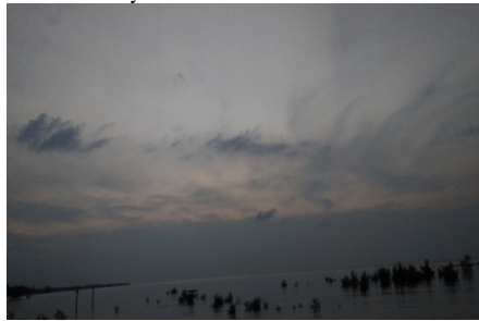
Figure 6: The state of the western horizon at 18:22 WIB.

At 18:08 WIB, the sun was no longer visible, only a red beam of light was visible on the western horizon. At 18:20 WIB the western horizon is getting dark, the sun is no longer visible on the western horizon, and the possibility for hilal visibility is very unlikely to see the condition of the horizon that has been covered by clouds.