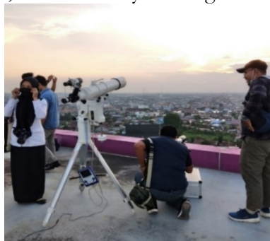
Figure 2: Observation Location at The Zuri Hotel with Hisab Rukyat Team

The author conducted a survey to the field and conducted rukyatul hilal for the beginning of Ramadan 1442H/April 12, 2021. For his observation, the hilal was carried out on the top roof top at The Zuri Hotel. From above you can see all the scenery of Dumai city, the factory smoke in Dumai City, the state of view where there is a lot of factory smoke causes a little fog on the western horizon. Based on the monitoring results until at 18:18 WIB the interval of 17 minutes hilal was not visible due to natural conditions that were slightly cloudy and foggy, the sun set at 18:19:49 WIB, but before sunset, the sun was no longer visible because it was covered by clouds and factory smoke. Meanwhile, based on the results of calculations that have been carried out, hilal is already at 3 degrees.