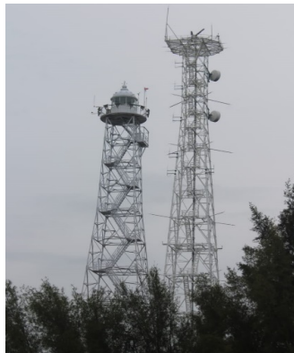
Figure 7: Lighthouse (right) and Radar Tower (left)

Tanjung Jaya Beach Teluk Rhu Village located in North Rupert is one of the beaches that has a long coastline. Tanjung Jaya Beach in Teluk Rhu also has a Lighthouse and a Radar Tower. The lighthouse which has 12 levels, from above the height of the 360-degree view at the top of the tower, will be seen Tanjung Rusa in Port Dickson Malacca, because this beach is directly facing the Strait of Melaka. While the Radar Tower is used for navigation systems. 35 Physically this lighthouse is worthy to be used as a facility where rukyatul hilal is carried out, because based on the physical structure of this lighthouse is a sturdy building whose frame is made of a mixture of iron and steel and also requires energy to get to the top of the lighthouse.