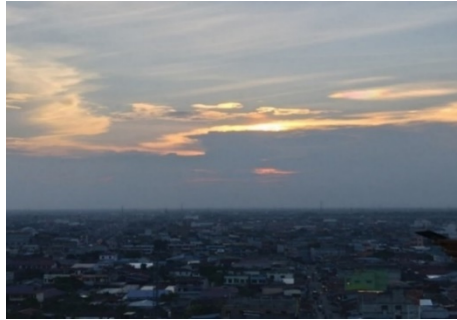
Figure 3: The appearance of the horizon as the sun begins to set is covered by thick, slightly misty clouds.

WIB, but the conditions and natural conditions at that time were thick clouds and fog caused by factory smoke so until 18:18 WIB the hilal had not been seen and only reddish light splashes from the sun were covered by visible clouds. In the horizon area, it is very difficult to predict and the visibility of the hilal. Here is what the horizon looks like when the sun is about to set.