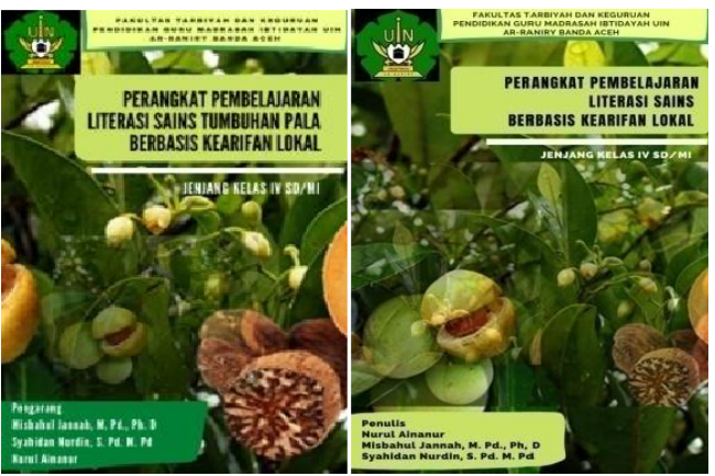
FIGURE 1. Cover Design

a. Cover page, there are differences before and after revision according to the suggestions given by the validator. The form of the suggestion is that the pictures and colors on the cover can attract students' interest in learning, and are appropriate based on the contents of the learning device.