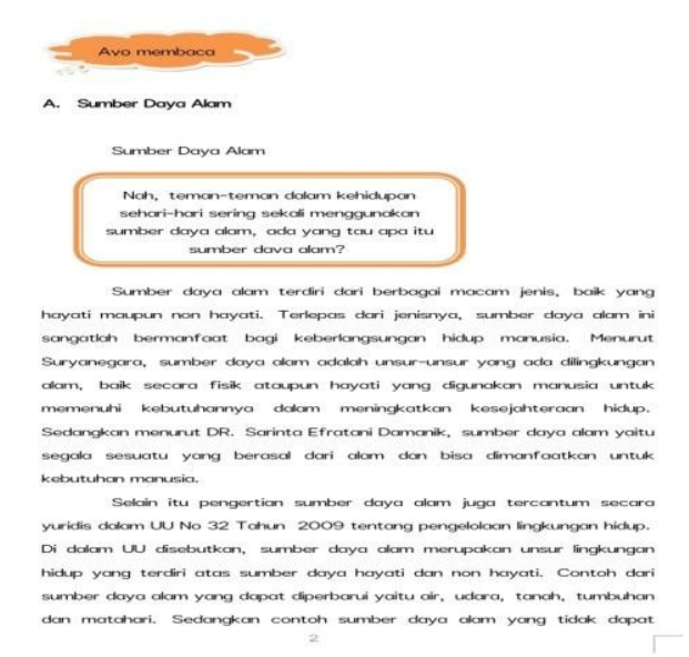
FIGURE 2. Material